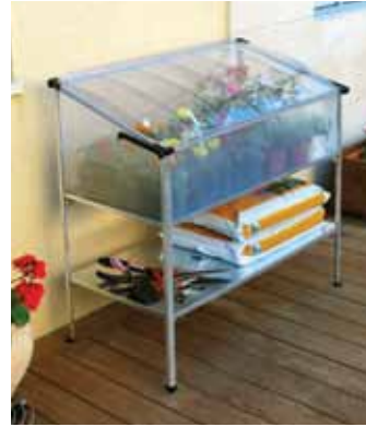
Closed Frosts & pests protection