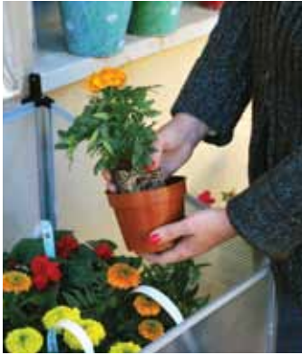
Open No Lid Potting inside