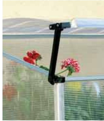
Half Open Ventilation & humidity control