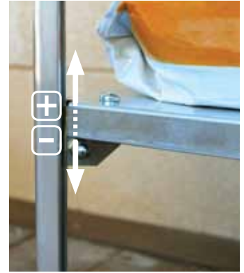
Adjustable shelf for organizing tools and soil included